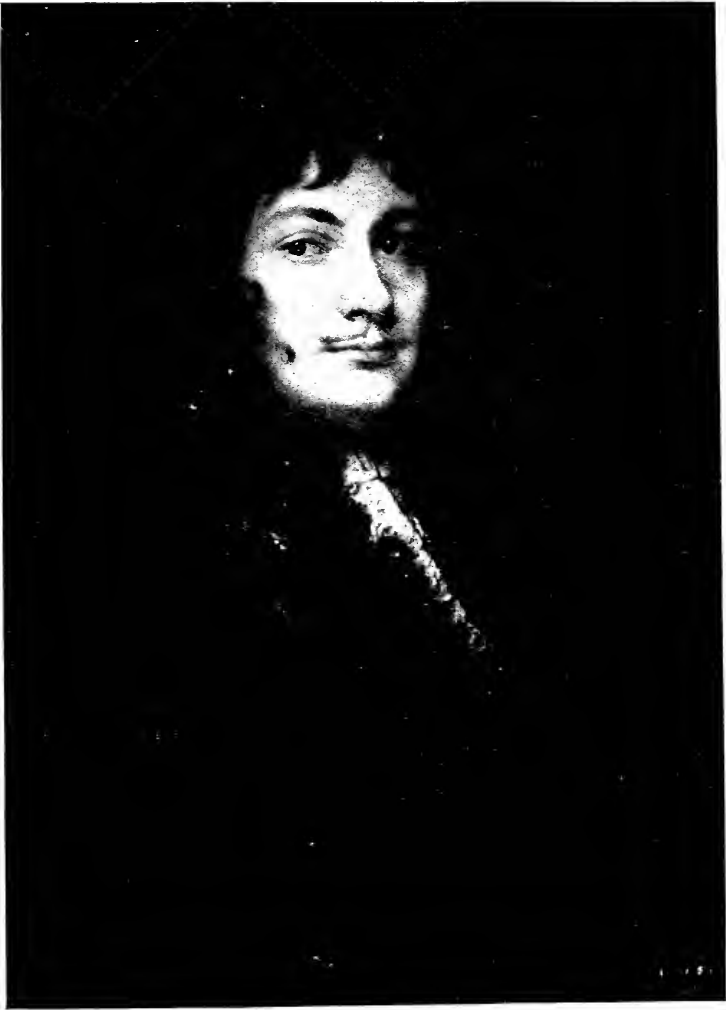
SIR WILLIAM TEMPLE 1628—1699

From the painting by Sir Peter Lely—No. 152, National Portrait Gallery, London